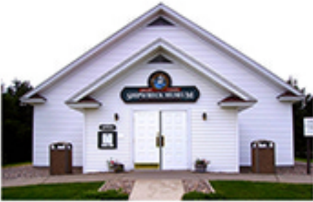
Great Lakes Shipwreck Museum