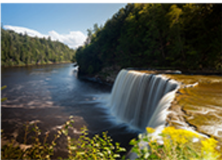
Upper Tahquamenon Falls