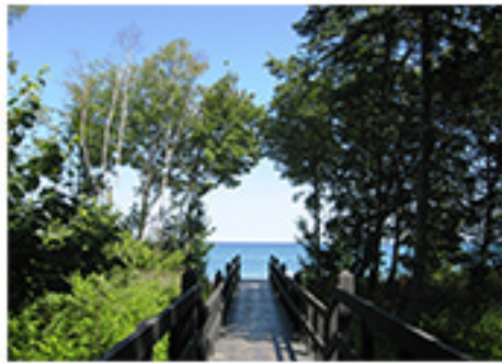
Muskallonge State Park