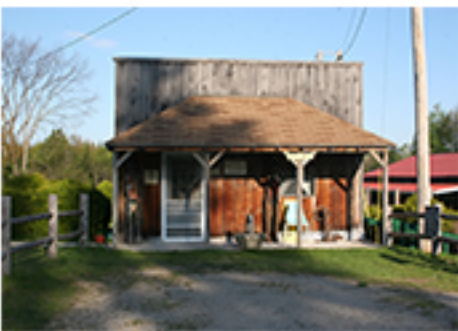
Tahquamenon Logging Museum