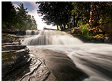
Lower Tahquamenon Falls