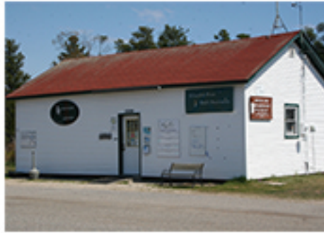
Whitefish Point Bird Observatory