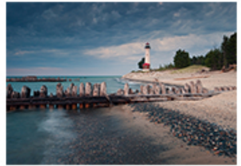
Crisp Point Lighthouse