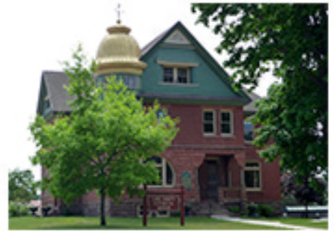
Luce County Historical Museum