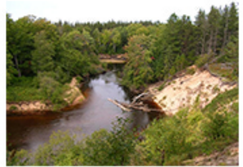
Two Hearted River