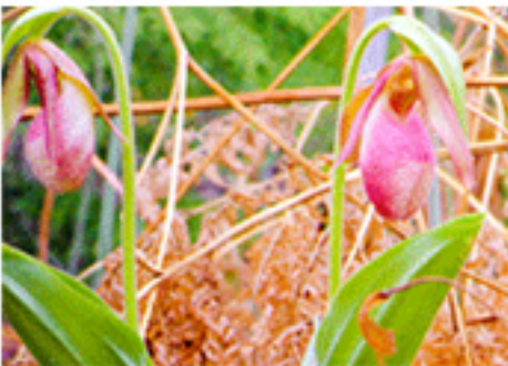
Hamilton Lake Natural Area