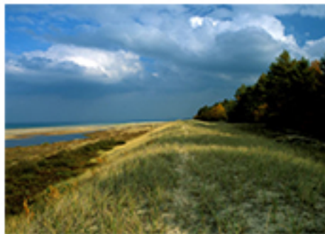
Curly Lewis Memorial Highway